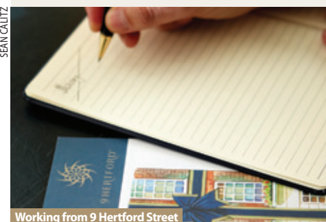
Working from 9 Hertford Street

Whether you'd like to complete your yoga routine in the comfort of your apartment or in the peaceful surroundings of one of our Royal Parks, our concierge will be able to supply you with yoga mats for your convenience.