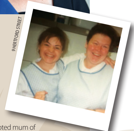
9 HERTFORD STREET