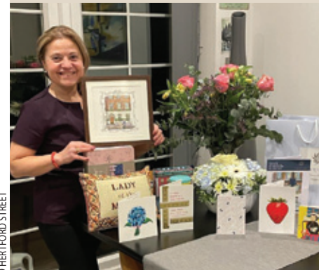
9 HERTFORD STREET

“ Your friendliness and smiles brightened my time away from home. ”