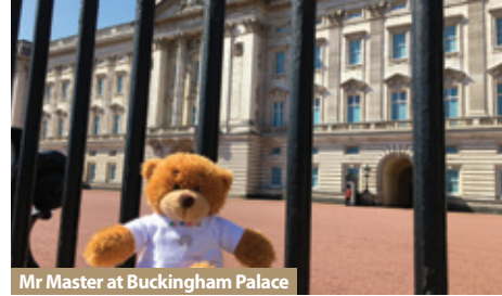
9 HERTFORD STREET