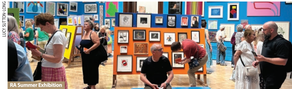
RA Summer Exhibition