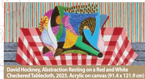
David Hockney, Abstraction Resting on a Red and White Checkered Tablecloth , 2025. Acrylic on canvas (91.4 x 121.9 cm)

This prestigious open submission exhibition features the works of both emerging and established artists.