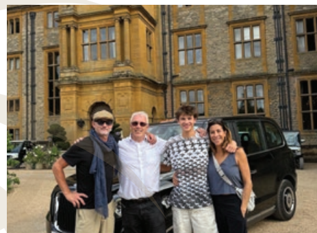
DISCOVER REAL LONDON

This walled city has a fascinating history, dating from Roman times and with a Viking past, too. Highlights include the Gothic cathedral York Minster, the National Railway Museum (home to the world's fastest steam locomotive, The Mallard), The Shambles medieval cobbled street and Betty's Tea Rooms.