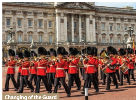
Changing of the Guard

Peter Pan in Kensington Gardens, J M Barrie