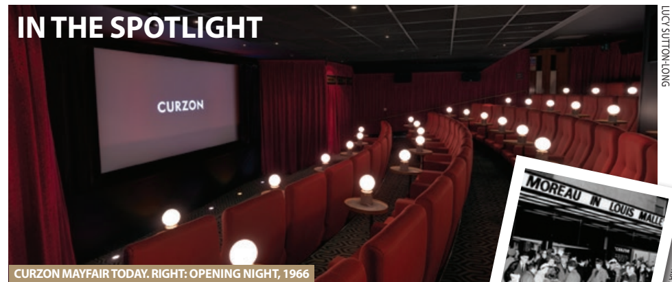
CURZON MAYFAIR TODAY. RIGHT: OPENING NIGHT, 1966