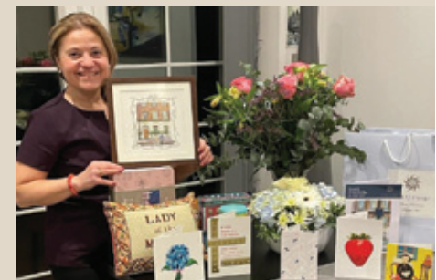
9 HERTFORD STREET

Keep in touch and hear our latest news via social media